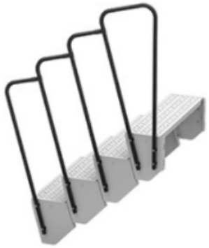
Railing without filling