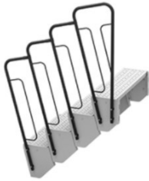
Railing with filling